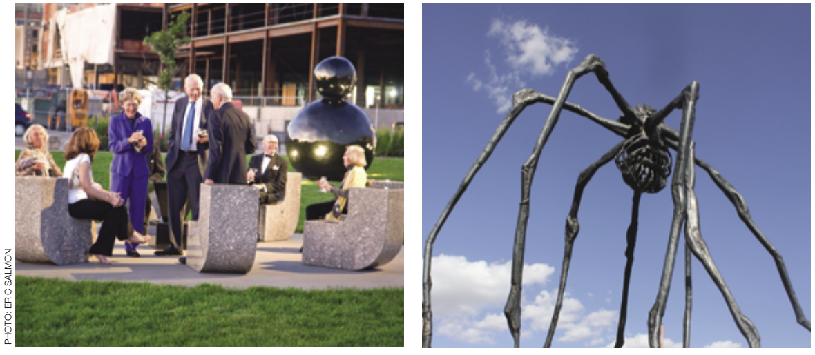
LEFT Gala guests gathered at Scott Burton's Seating for Eight and Café Table 1. RIGHT Louise Bourgeois' Spider (detail)