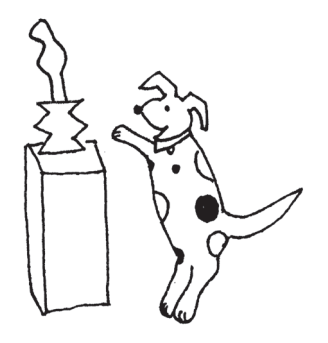
Look with your eyes, not your hands.

The Des Moines Art Center is a great place for families to grow a love of art. By following these museum manners, you'll be sure to have an enjoyable visit and help protect the art.