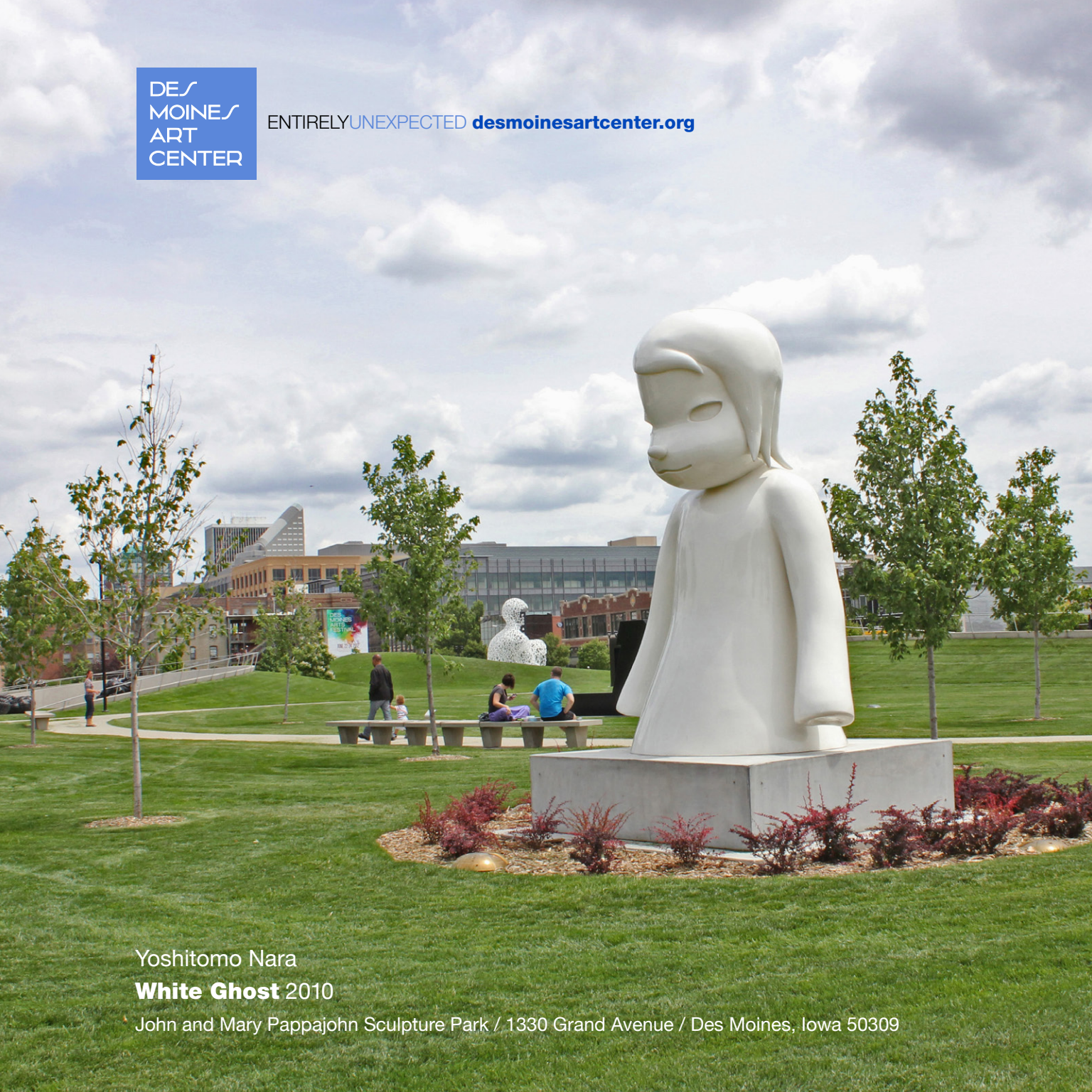
Yoshitomo Nara White Ghost 2010

ENTIRELY UNEXPECTED desmoinesartcenter.org