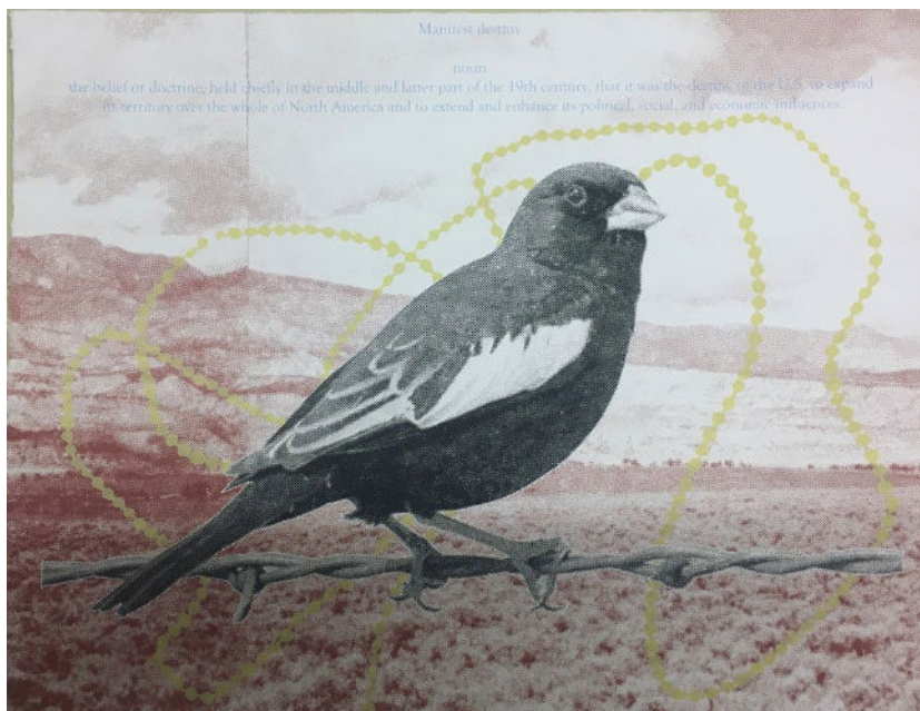
Gina Adams (American, born 1965) American Progress , 2019 Four-layer silkscreen with embossment; 9 × 12 in. (22.9 × 30.5 cm.) Edition of 60 with 5 artist's proofs Print Club members: $300; non-members $375