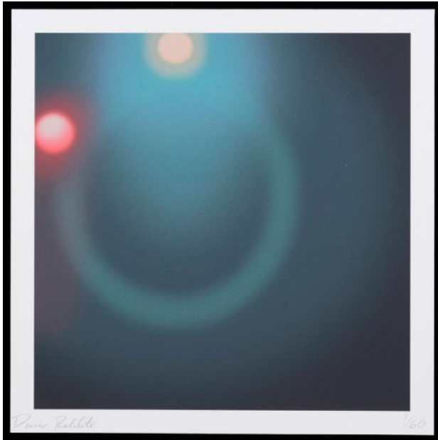
Dario Robleto (American, born 1972) The Sky, Once Choked with Stars, Will Slowly Darken (Nelson) , 2011 Archival Digital Print; 8 x 8 inches (image) Edition of 60 + 5 artist's proofs Print Club members $300; Non-members $375