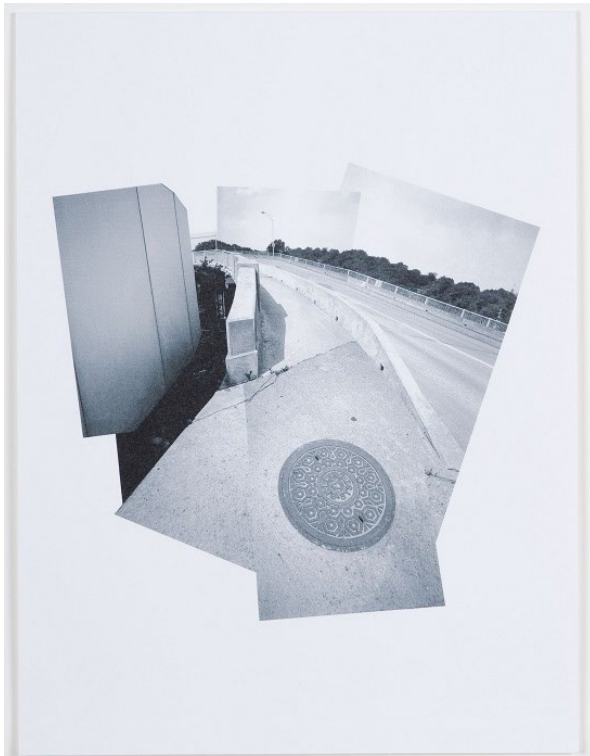
Mary Miss (American, born 1944) Photo Drawing (Fleur Bridge) , 1996 Digital Iris on paper; 11 5/8 x 8 13/16 inches (sheet) Edition of 50 with 5 artist's proofs Print Club members $200; Non-members $250