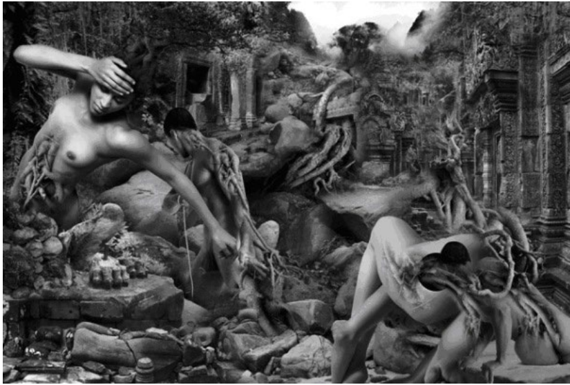
Ignatius Widiapradja (American, born Indonesia 1960) Four Quartets , 2012 Archival Digital Print; 7 x 10.5 inches (image) Edition of 60 + 5 artist's proofs Print Club members $150; Non-members $188