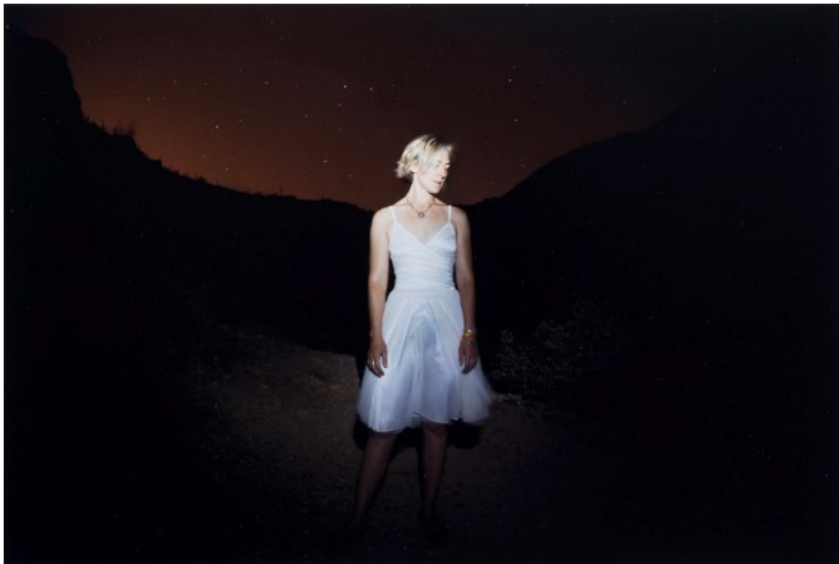
Laurel Nakadate (American, born 1975) Tucson, Arizona #3 , from the Star Portraits series, 2011 (printed 2015) Type-c digital print, 7 5/16 x 11 inches (image) Edition of 60 with 5 artist's proofs Print Club members $400; Non-members $500