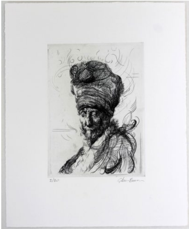
Glenn Brown (British, born 1966) The Artist's Father , 2017 Etching on paper Somerset White Velvet; 6 x 4.5 inches (image) Edition of 60 with 10 artist's proofs Print Club members $680; Non-members $850