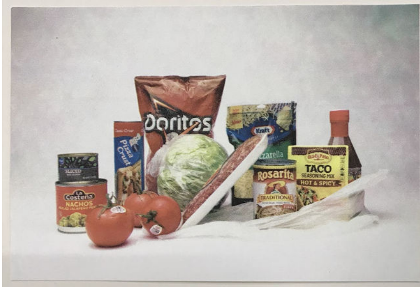
Justin Favela (American, born 1986) Taco Pizza Harvest , 2021 Screenprint; 8 × 11 7/8 in. (20.3 × 30.2 cm.) Edition of 50 with 5 artist's proofs Print Club members: $300; non-members $375