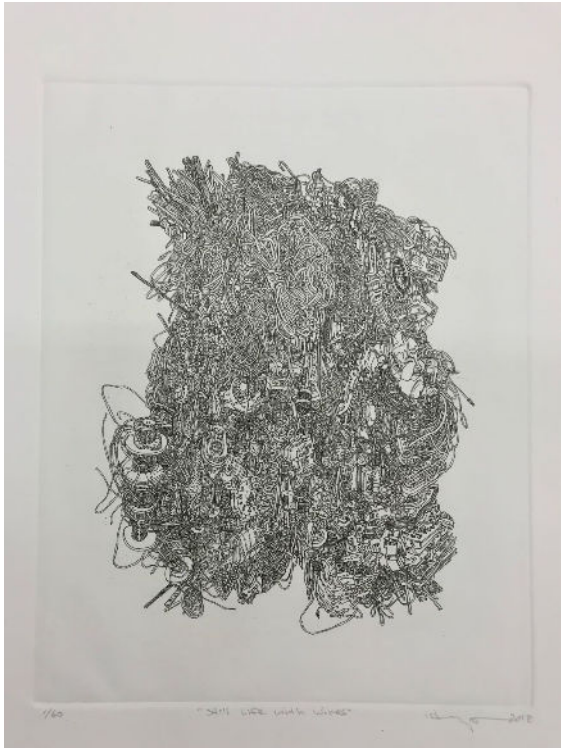
Heeseop Yoon (Korean, born 1976) Still Life with Wires , 2018 Etching on paper; 15 x 13 inches, 10 x 8 inch plate Edition of 60 with 5 artist's proofs Print Club members: $300; non-members $375