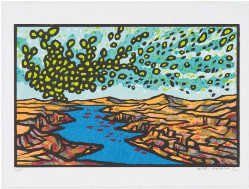
Endi Poskovic (Bosnian-American, born 1969) River Landscape with Salty Air in Green , 2006 Color woodcut on paper; 7 x 11 inches (image) Edition of 75 + 5 artist's proofs Print Club members $150; Non-members $188