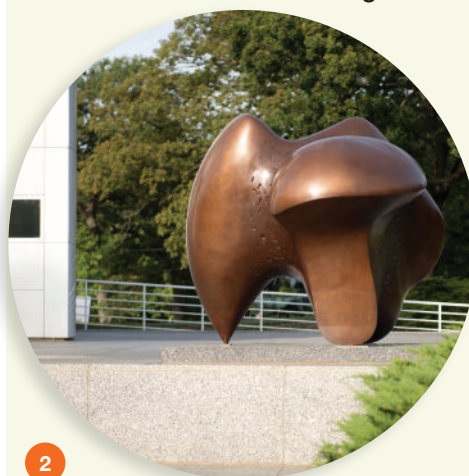
Front (north) plaza of the Richard Meier building

RICHARD SERRA American, born 1938 Standing Stones 1989 Six granite blocks 4.5 x 559.9 x 100 feet