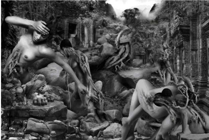
Ignatius Widiapradja (American, born Indonesia 1960) Four Quartets , 2012 Archival Digital Print; 7 x 10.5 inches (image) Edition of 60 + 5 artist's proofs Print Club members $150; Non-members $188