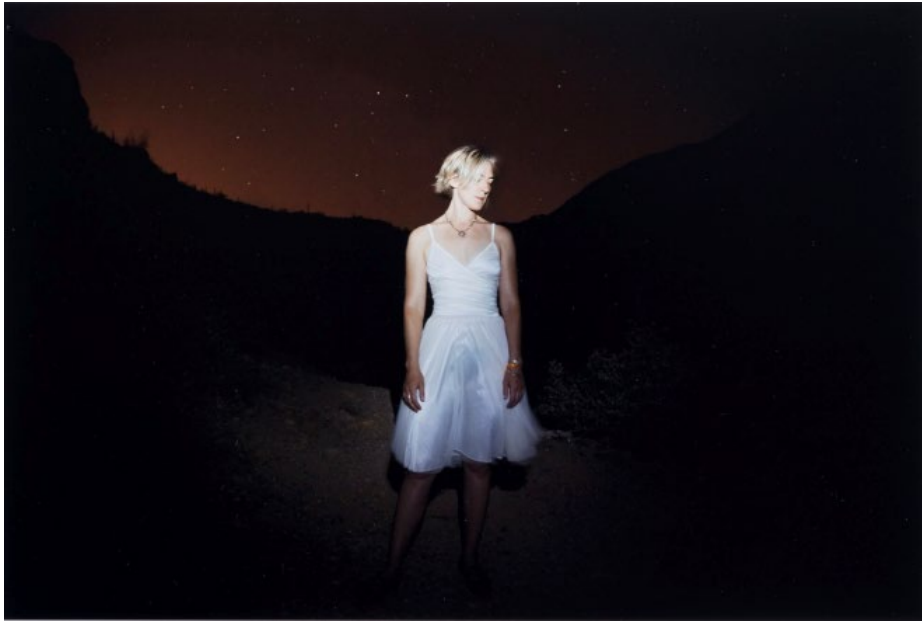
Laurel Nakadate (American, born 1975) Tucson, Arizona #3 , from the Star Portraits series, 2011 (printed 2015) Type-c digital print, 7 5/16 x 11 inches (image) Edition of 60 with 5 artist's proofs Print Club members $400; Non-members $500