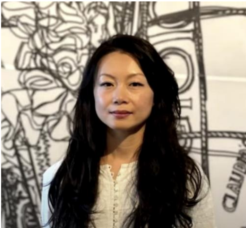
Artist statement and photo from heeseopyoon.com

"My work deals with memory and perception within cluttered spaces. I begin by photographing interiors such as basements, workshops, and storage spaces, places where everything is jumbled and time becomes ambiguous without the presence of people. From these photographs I construct a view and then I draw freehand without erasing. As I correct "mistakes" the work results in double or multiple lines, which reflect how my perception has changed over time and makes me question my initial perception. Paradoxically, greater concentration and more lines make the drawn objects less clear. The more I see, the less I believe in the accuracy or reality of the images I draw."