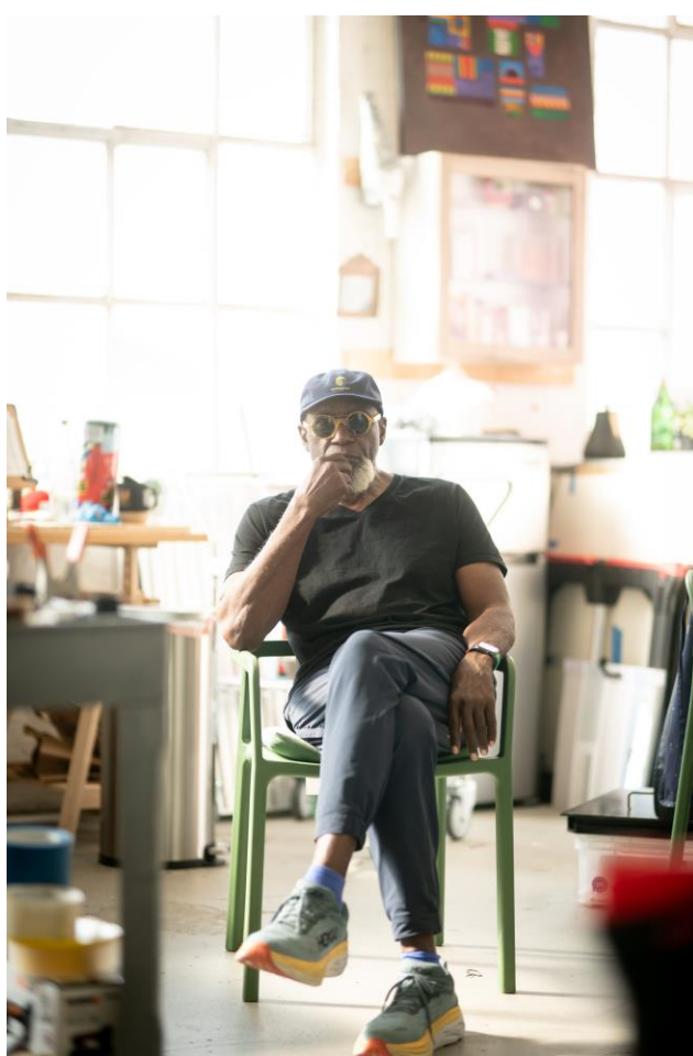
Artist statement and photo from clarence-morgan.com

"I am interested in an approach to art making that explores the often-conflicted relationship between the decorative traditions in geometric patterns found in other cultures and western modernism. However, the recent paintings, prints and collage-drawings avoid culturally specific subject matter in favor of a more elusive pictorial terrain of contemporary abstraction. Inasmuch, my work attempts to reflect a broader generational curiosity where the familiar and unfamiliar converge.