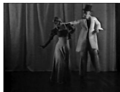
Roger Pryor Dodge (American, 1898–1974) and Mura Dehn (Ukrainian American, 1905–1987), East St. Louis Toodle-0o , 1937, single-channel video, 16mm transferred to digital.