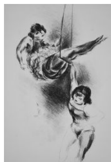
Yasuo Kuniyoshi (American, 1889–1953), Trapeze Performers , 1928, lithograph on paper. Figge Art Museum, City of Davenport Art Collection, Friends of Art Acquisition Fund, OP97.

The thin lines he uses to outline these spectators do not totally enclose the shapes of heads, necks, and arms, necessitating the viewer to lean in and look carefully to ascertain the characters and relationships rendered.