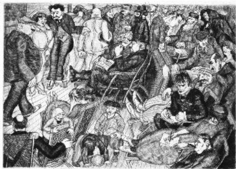
Peggy Bacon (American, 1895–1987), Promenade Deck , 1920, drypoint on paper. Stanley Museum of Art; museum purchase, 1977.69.

In her caricature of Kuniyoshi in Off With Their Heads! , Bacon described her friend as “dreamy and introspective” with an “air of absent indifference” and “remote as though overhearing a conversation in the next room.” 23 This description aligns with the depictions of Kuniyoshi in both Bacon’s A Few Ideas and Carroll’s