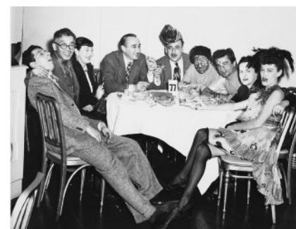
Seymour Lipton, Yasuo Kuniyoshi, and others at the Artists Equity Ball, December 1950.

Kuniyoshi, Dehn made prints with Desjobert. He depicted “aperitif hour” in Paris’s outdoor cafés; bistro scenes; the Grand Guignol theater, which specialized in horror shows; and numerous music and dance performances. In the print Lohengrin , 1928, Dehn captured a lavish performance of the Richard Wagner opera, perhaps