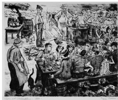
Peggy Bacon (American, 1895–1987), Clams and Clodhoppers , 1933, drypoint on paper. Figge Art Museum, Friends of Art Acquisition Fund, 2014.13

Kuniyoshi had enrolled at the Art Students League in 1916, after a decade of traveling around