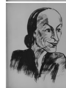
Peggy Bacon (American, 1895–1987), Off With Their Heads! , third edition, (Robert M. McBride & Company, 1934). Caricatures of Yasuo Kuniyoshi and Georgia O’Keeffe.