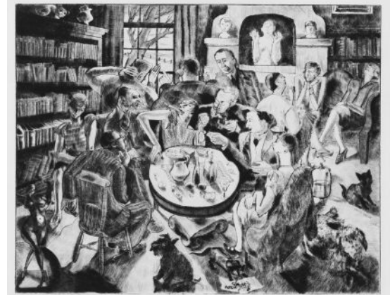
Peggy Bacon (American, 1895–1987), A Few Ideas, 1927, drypoint on paper. Des Moines Art Center Permanent Collections; Purchased with funds from the Sharon Simmons Art Acquisitions Fund, 2025.10.

being a keen observer of the art world, Bacon frequently turned her attention to regional scenes, as in Promenade Deck , 1920, and Clams and Clodhoppers , 1933. She also wrote and illustrated dozens of mass market books, including the 1934 volume Off With Their Heads! , which contained lampoons of Georgia O’Keeffe, critic and humorist Dorothy Parker, and composer George Gershwin, who created the symphonic poem