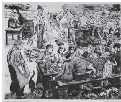
Peggy Bacon (American, 1895–1987), Clams and Clodhoppers , 1933, drypoint on paper. Figge Art Museum, Friends of Art Acquisition Fund, 2014.13

Kuniyoshi had enrolled at the Art Students League in 1916, after a decade of traveling around