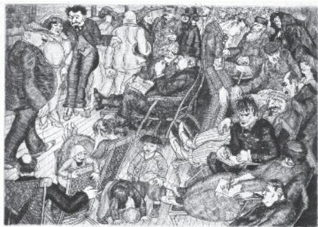
Peggy Bacon (American, 1895–1987), Promenade Deck , 1920, drypoint on paper. Stanley Museum of Art; museum purchase, 1977.69.

In her caricature of Kuniyoshi in Off With Their Heads! , Bacon described her friend as “dreamy and introspective” with an “air of absent indifference” and “remote as though overhearing a conversation in the next room.” 23 This description aligns with the depictions of Kuniyoshi in both Bacon’s A Few Ideas and Carroll’s