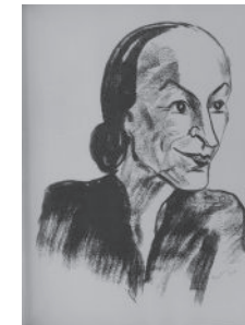
Peggy Bacon (American, 1895–1987), Off With Their Heads! , third edition, (Robert M. McBride & Company, 1934). Caricatures of Yasuo Kuniyoshi and Georgia O’Keeffe.