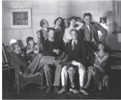
Peter A. Juley & Son, group portrait, c. 1930.