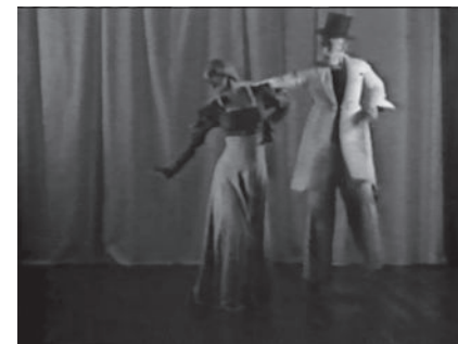
Roger Pryor Dodge (American, 1898–1974) and Mura Dehn (Ukrainian American, 1905–1987), East St. Louis Toodle-oo , 1937, single-channel video, 16mm transferred to digital.

The thin lines he uses to outline these spectators do not totally enclose the shapes of heads, necks, and arms, necessitating the viewer to lean in and look carefully to ascertain the characters and relationships rendered.